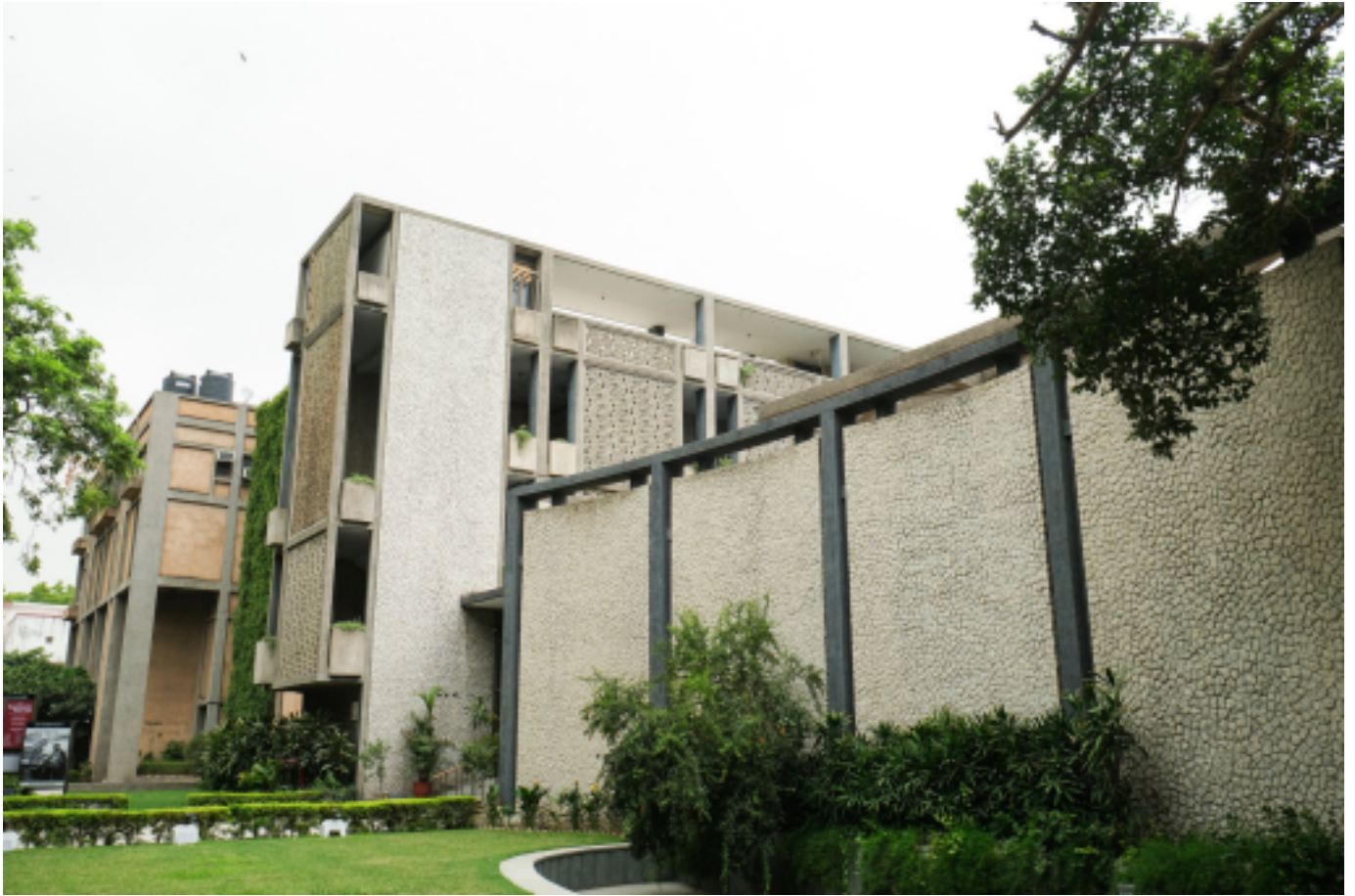
Centre for the Confluence of Art and Culture